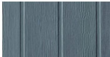
Color shown: Boothbay Blue