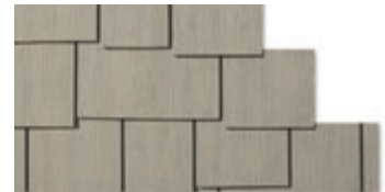
Color shown: Monterey Taupe