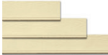
Color shown: Woodland Cream