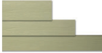
Color shown: Heathered Moss