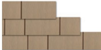
Color shown: Khaki Brown