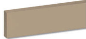
Color shown: Khaki Brown