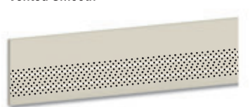
Color shown: Navajo Beige