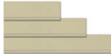
Color shown: Sandstone Beige