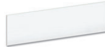
Color shown: Arctic White