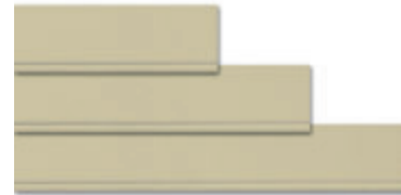
Color shown: Sandstone Beige