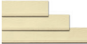
Color shown: Woodland Cream