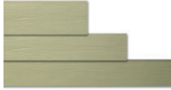
Color shown: Heathered Moss