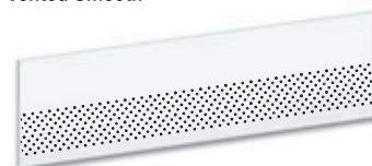
Color shown: Arctic White