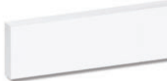
Color shown: Arctic White