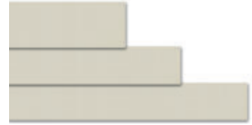
Color shown: Cobble Stone