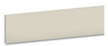
Color shown: Navajo Beige